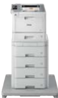
HL-L9310cdw PLUS TOWER TRAY OPTION*