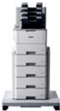
HL-L6400dw PLUS TOWER TRAY AND MAILBOX/SORTER/STACKER OPTIONS*