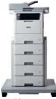
MFC-L6900dw PLUS TOWER TRAY OPTION*