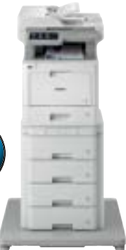
MFC-L9570cdw PLUS TOWER TRAY OPTION*